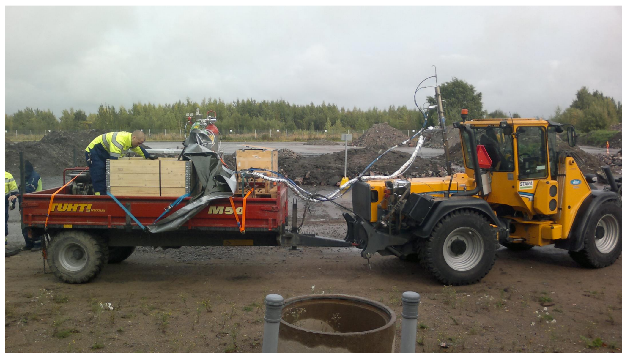
Fig. 1 PEMS installed into a trailer towed by the loader.

The measurement cycle was selected to consist of different activities: idle, lifting, driving and driving with extra load to simulate snow plowing