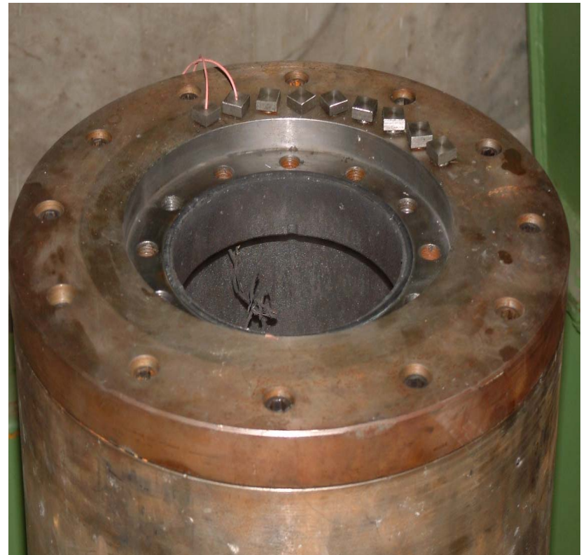
Fig.3) Chamber of detonation with 22 liters volume