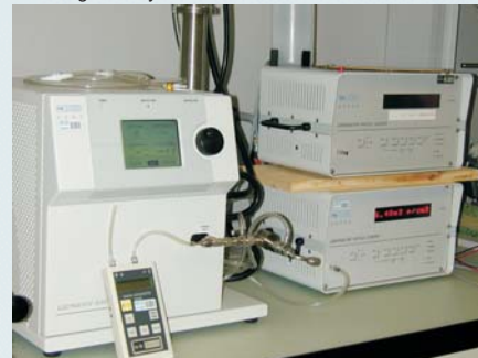
Scanning Mobility Particle Sizer - SMPS

Optical particle counters are measuring instruments that classify and count particles according to the scattered light intensity (size). They determine the number concentration in several size classes (typical lower diameter limits are: 0.3, 0.5, 0.7, 1.0 to 5.0 \mu\text{m} ). Optical particle counters are required for monitoring clean rooms according the standard ISO 1644-1.