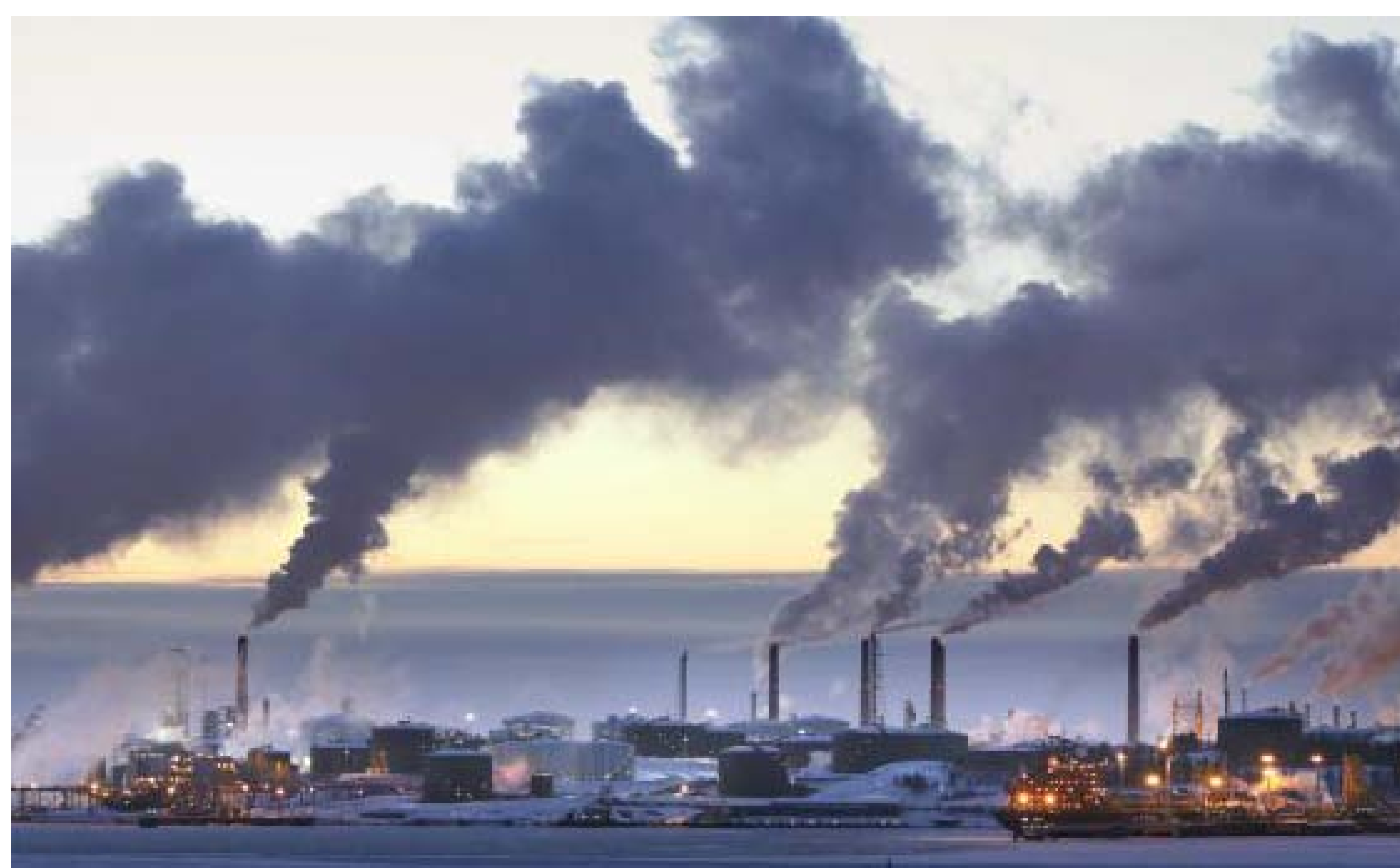
Figure 1. Porvoo industrial area

In Kilpilahti industrial area there are about 6000 tons of sulfur dioxide emissions yearly. Sulfur dioxide oxidizes to sulphuric acid when adequate catalyst, for example hydroxyl radical (OH - ), is present. OH - concentration has a strong diurnal cycle which causes the sulfuric acid concentration to usually be lower during night and the highest around noon[1]. Sulfuric acid has an important role in the initial steps of nucleation[2].